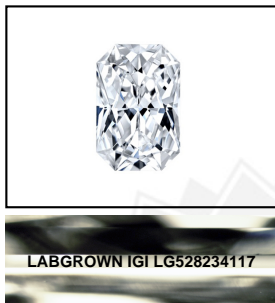
LASERSCRIBE SM Sample Images Used

Comments: This Laboratory Grown Diamond was created by Chemical Vapor Deposition (CVD) growth process and may include post-growth treatment. Type IIa