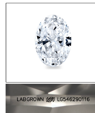
LASERSCRIBE SM Sample Image Used