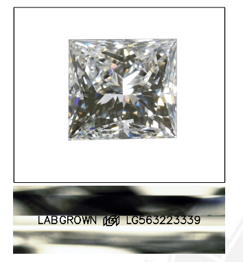
LASERSCRIBE<sup>SM</sup> Sample Image Used