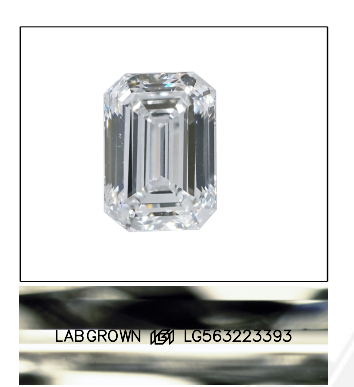
LASERSCRIBE<sup>SM</sup> Sample Image Used