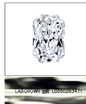
LASERSCRIBE SM Sample Image Used