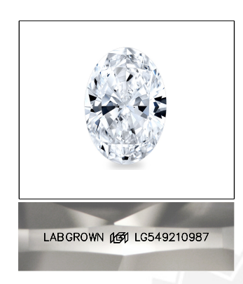
LASERSCRIBE<sup>SM</sup> Sample Image Used