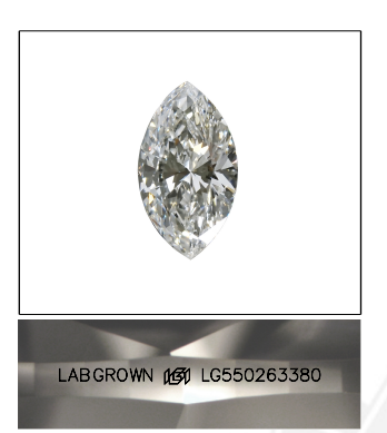
LASERSCRIBE<sup>SM</sup> Sample Image Used