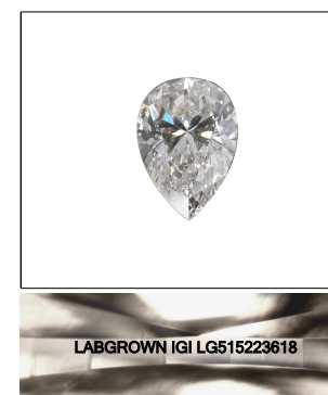
LASERSCRIBE SM Sample Image Used