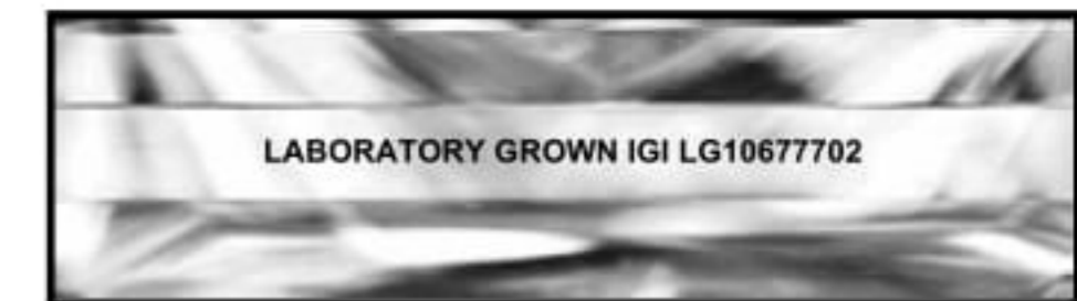
LASERSCRIBE SM Photo Illustration